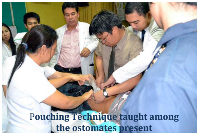
Pouching Technique taught among the ostomates present

The celebration of World Ostomy Day centered in promoting ostomy awareness and quality of life for ostomates. A fellow patient willingly allowed himself to demonstrate how to change the pouch with the help of doctors, in the presence of newly operated ostomates. The half-day affair was capped with a group picture and then snacks were served.