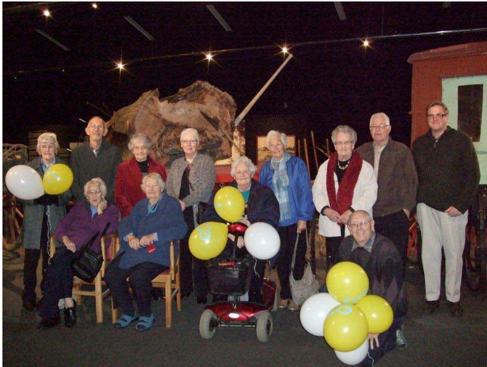
Manawatu's World Ostomy Day 2012