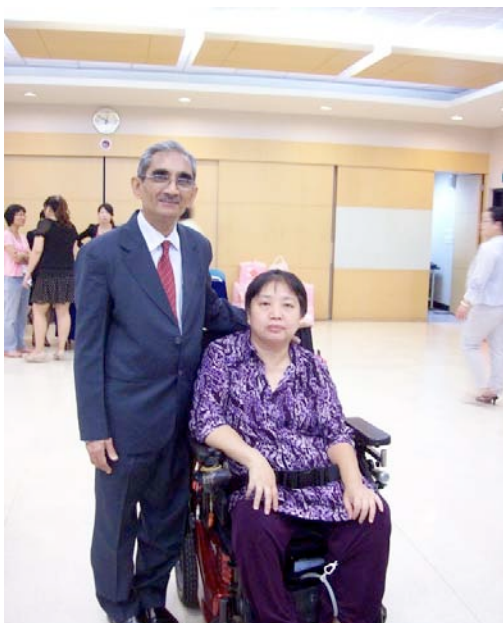
Ostomate attending the WOD

On the day of arrival in the evening I had dinner with Executive members of TOWCNA (Taiwan Ostomy Wound Continence Nurses Association).