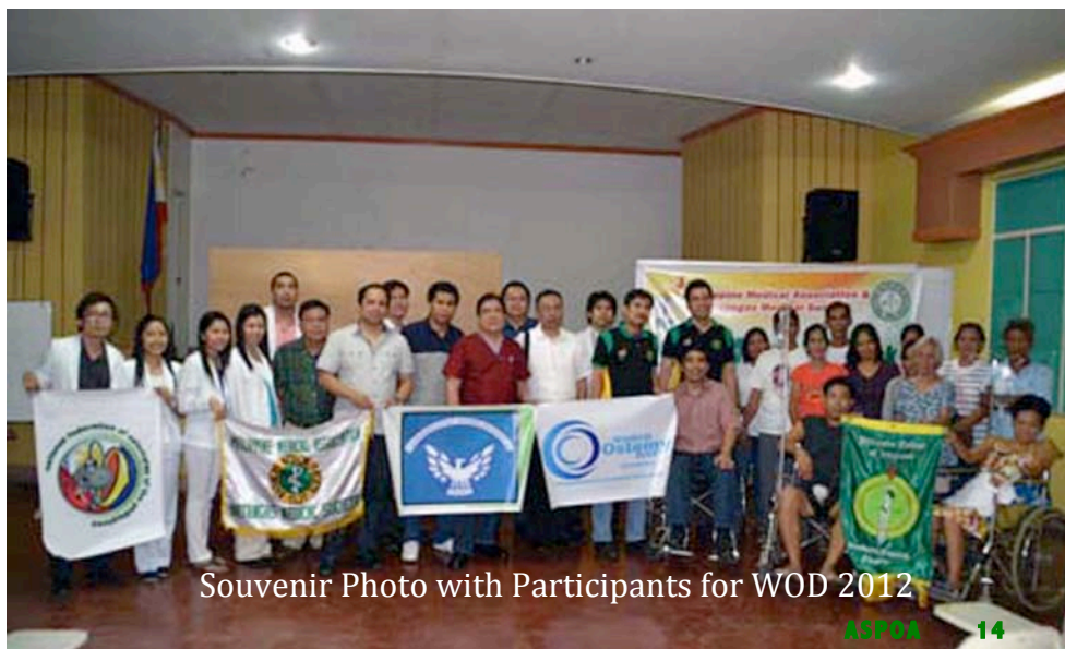
Souvenir Photo with Participants for WOD 2012