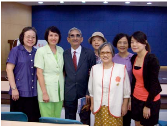
TOWCNA Members and Members of Rose Club.